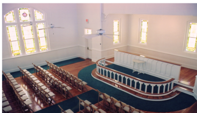
WHITE CHAPEL 1113 Michigan Avenue Palm Harbor, Florida 2,889 sq.ft. Historic Preservation / Renovation