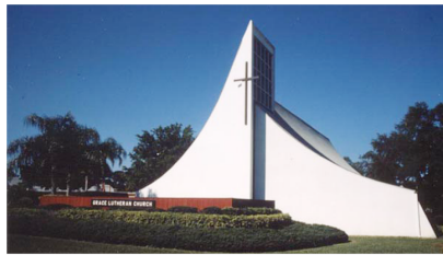
GRACE LUTHERAN CHURCH 1812 N Highland Ave Clearwater, Florida 40,000 sq.ft. New Construction / Renovation

In 1975, Rod Collman completed construction drawings for the new Our Lady of Lourdes Catholic Church in Dunedin. In 2014, Collman was chosen to design a new church interior, nave and sanctuary platform by Our Lady of Lourdes and the Catholic Diocese of St. Petersburg. The project was completed in January, 2015.