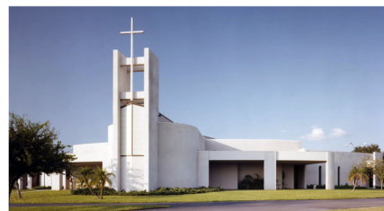
OUR LADY OF LOURDES CHURCH 750-A San Salvador Drive Dunedin, Florida 11,400 sq.ft. New Construction / Renovation