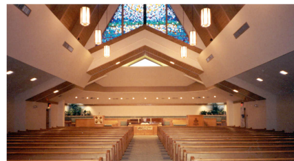
NORTHWOOD PRESBYTERIAN CHURCH 2875 State Road 580 Clearwater, Florida Family Life Center / Sanctuary: 14,240 sqft New Construction / Renovation