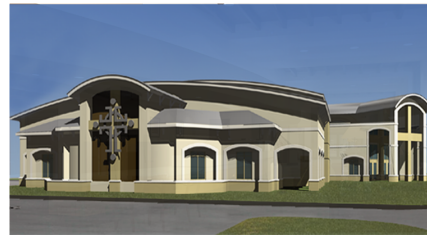
FAITH COVENANT CHURCH - PHASE II 160 62nd Avenue St. Petersburg, Florida 46,076 sq.ft. New Construction / Renovation