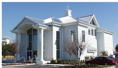
ISLAND CHAPEL 1271 Pinellas Bayway South Tierra Verde, Florida 7,632 sq.ft. New Construction