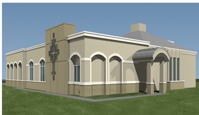
FAITH COVENANT CHURCH- PHASE I 160 62nd Avenue St. Petersburg, Florida 28,000 sq.ft. New Construction / Renovation