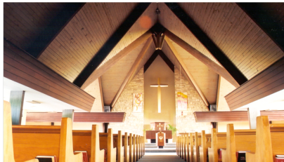
OUR SAVIOUR LUTHERAN CHURCH 301 58th Street South St. Petersburg, Florida Fellowship Hall, School & Youth Bldg: 8,000 sqft Admin Suite, Nursery, Narthex: 8,400 sqft