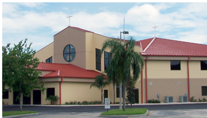
BIBLE BASED FELLOWSHIP CHURCH 4811 Ehrlich Road Tampa, Florida 37,000 sq.ft. New Construction