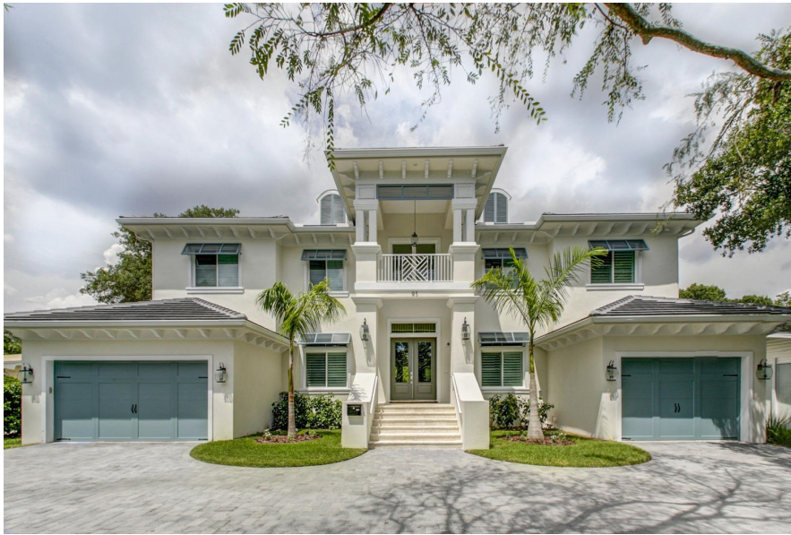
left: "Martinique" front view