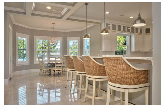
above: Kitchen and dining area