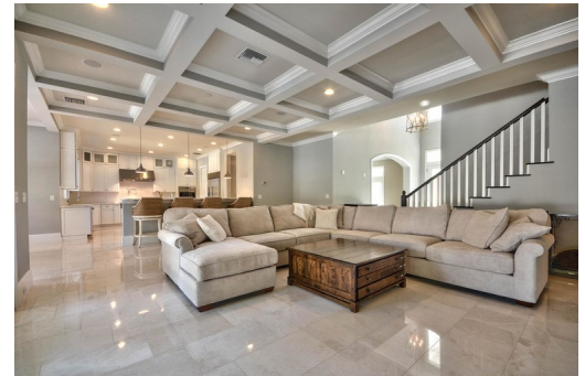
below: Living room

This West Indies style home illustrates our ability to create a living space on a uniquely shaped lot with strict municipal setback requirements. The owner wanted a tropical courtyard pool on a lot that was surrounded on three sides by streets. Additionally, parking was a problem. We created an auto court with access to entry while meeting the owner's requirements for a tropical pool visible from several points in the home.